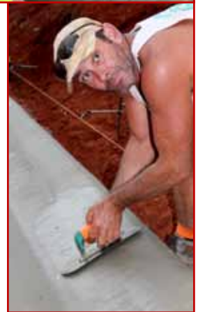
Top & Above: Road workers; Right: the fencing team